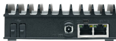
Back panel 2 x RJ45 2 x USB-A